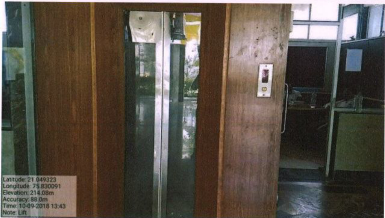
(b) Provision of Lift facility