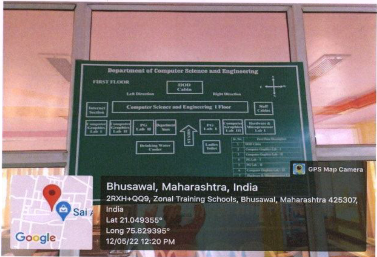
One of the Sign Post at Computer Science and Engineering Building