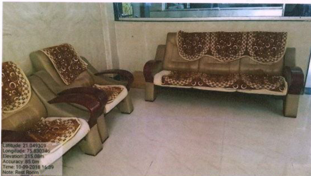
Restroom for Divyangjan